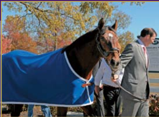
Alysheba arrives at Horse Park