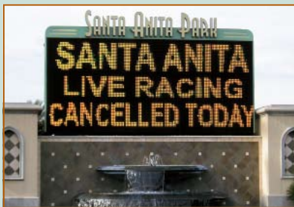
BENNETT &amp; ASSOCIATES

Drainage problems with the asphalt base of Santa Anita's Cushion Track brought racing in Southern California to a halt Jan. 5-7. The cancelled racing days were among a total of 11 missed dates that extended into the month of February as heavy rains in the Los Angeles area caused the track's mixture of fine sand and wax to clog the drainage pipes and flood the surface.