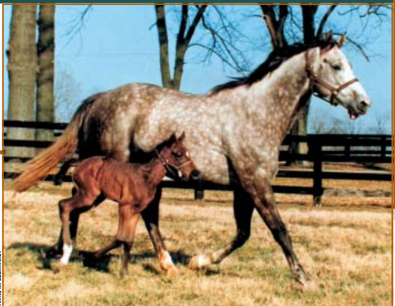
Winning Colors with her first foal

Bred in Kentucky by Echo Valley Horse Farm, Winning Colors was the most recent and one of only three fillies to win the Derby. She also won the Santa Anita Derby (gr. I) and Santa Anita Oaks (gr. I) for the late Eugene Klein and trainer D. Wayne Lukas.