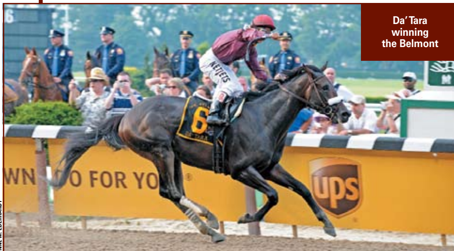
Da' Tara winning the Belmont