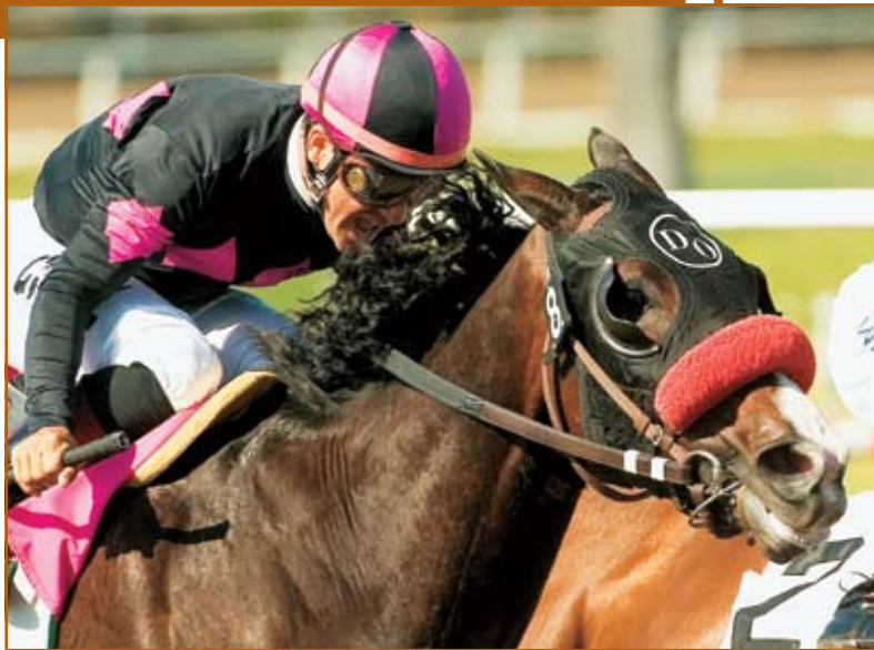
Fan favorite Lava Man wins his third consecutive Hollywood Gold Cup