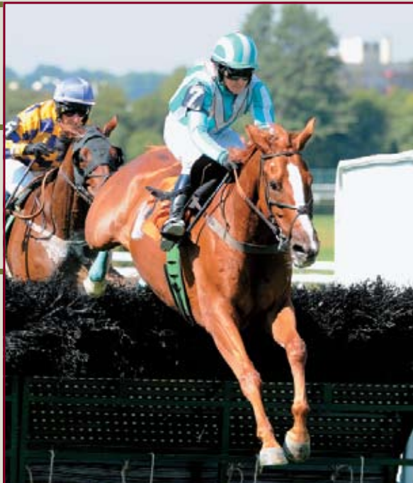
Good Night Shirt