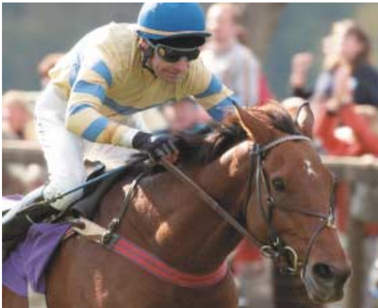
McDynamo left all comers in his wake in 2003

No, that's pointless right now. Since converting to steeplechase racing in 2001, McDynamo has won eight