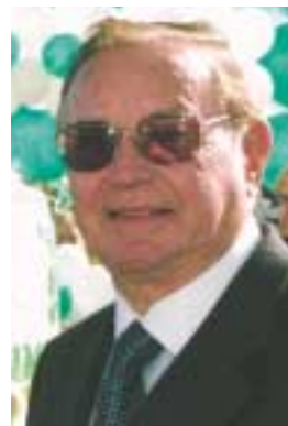
BENNETT & ASSOCIATES